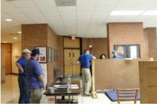
Chapter members participated in Engineering Day hosting a duct tape wall and KNEX bridge competitions.